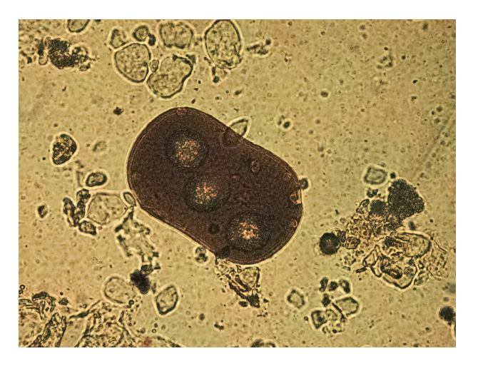
Fig. 2. Packet of eggs of Dipylidium caninum . Magnification 200×.

examination of proglottids showed characteristic brown packets with D. caninum eggs. There were a dozen or more packets in each proglottid containing from one to a few, mostly 3–4 eggs. In direct preparations in 0.9% sodium chloride and in Lugol's solution, single packets with D. caninum eggs were found. The decantation technique, revealed many D. caninum egg packets (Fig. 2). The eggs contained round oncospheres with thick embryonic membranes around them. Preparations